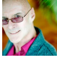
Ken Wilber. Founder of Integral Theory

"The central idea of Simpol is very powerful. That is, how to link votes in one country with votes in another; how to link political action in one country with action in another. International competition is built-in to the nation- state system at its current level of development, and so the issue is not environmental concerns, but how to get humans to agree on environmental concerns. This is really fascinating and very hopeful. In my opinion this is the crucial issue for the 21st Century".