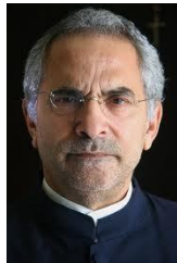
José Ramos-Horta. Nobel Peace Prize laureate.

"The Simultaneous Policy is a creative proposal to accelerate progress toward a sustainable global economy. Many movements and grass-roots globalists can coalesce around such innovative initiatives".